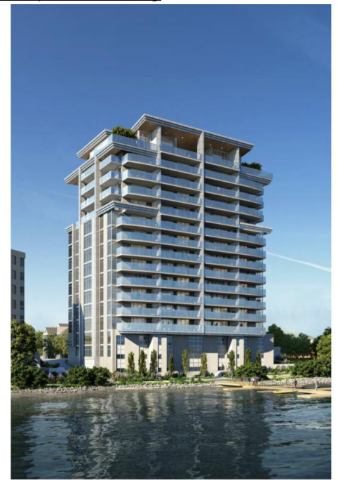
The complete submission package is posted on the <u>Proposed Developments</u> page on the City's website under <u>Ward 2.</u>