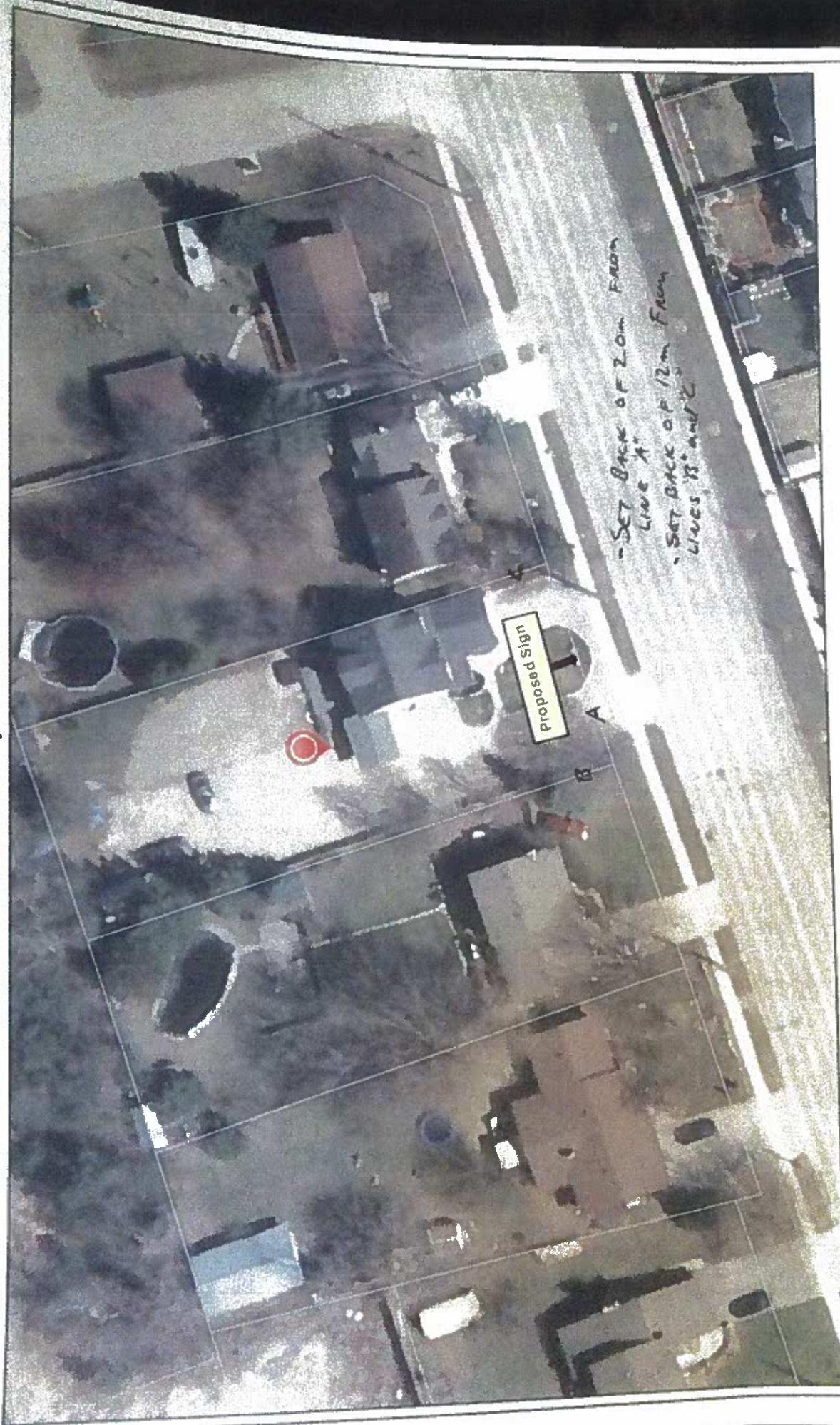
Aerial Photos flown in the spring of 2012