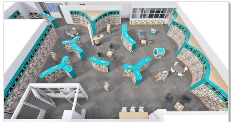
Rendering of Holly Community Library