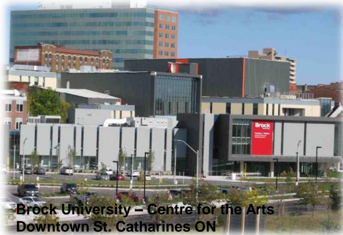
Brock University – Centre for the Arts Downtown St. Catharines ON