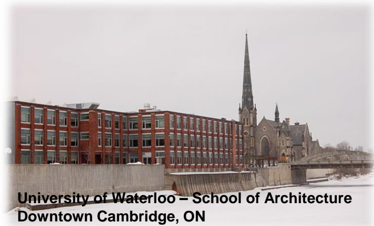
University of Waterloo – School of Architecture Downtown Cambridge, ON