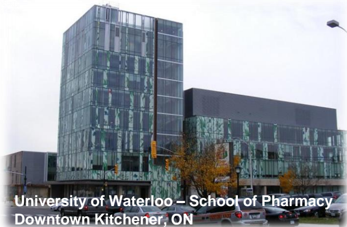
University of Waterloo – School of Pharmacy Downtown Kitchener, ON