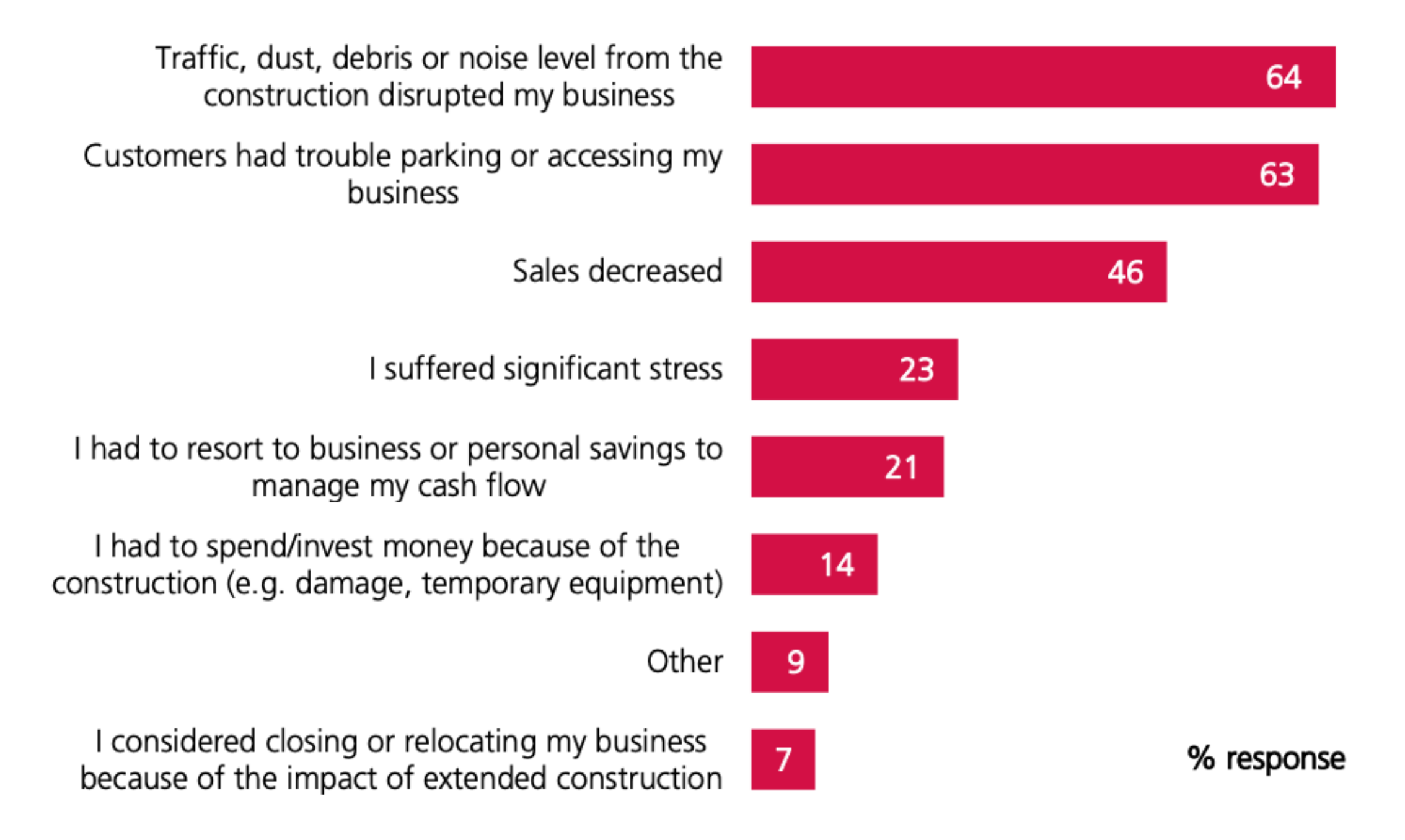
How were you and/or your business affected during the last five years?

Source: CFIB, national survey on municipal issues, Web, July 6 - July 26, 2017, 2,135 responses, ±2.1%, 19/20. Note: respondents were allowed to select as many answers as apply.