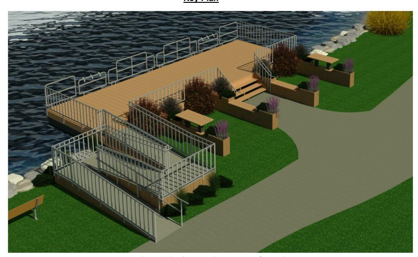
Perspective of Fishing Platform along Shoreline