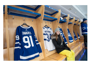
Maple Leafs Fan Zone